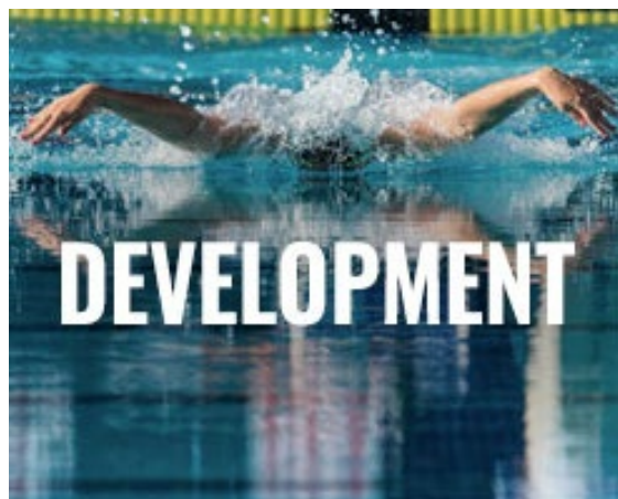
Season Dates, Recommended Developmental Competition