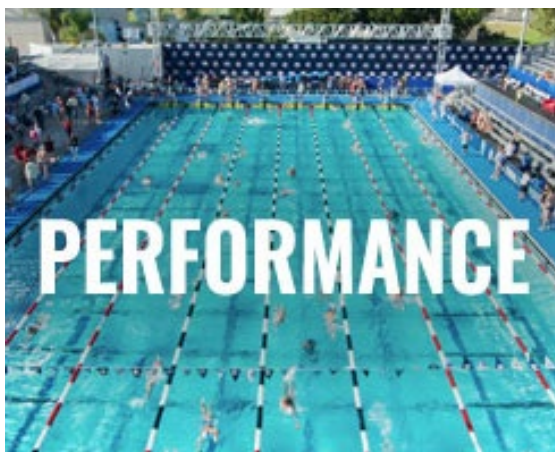
2020 U.S. Olympic Team Trials - Swimming Race Stats