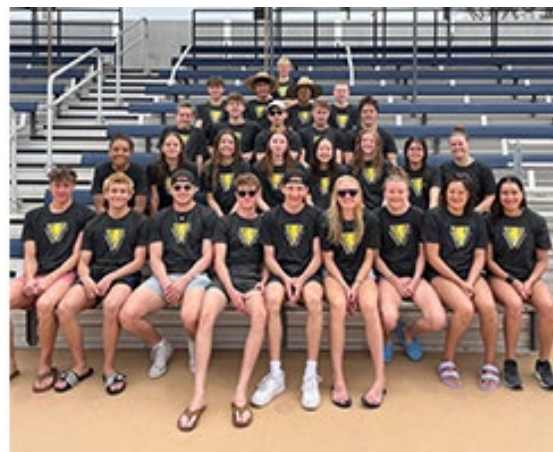
Chargers Aquatics Coach Utilizes Athlete Surveys to Gain Insights