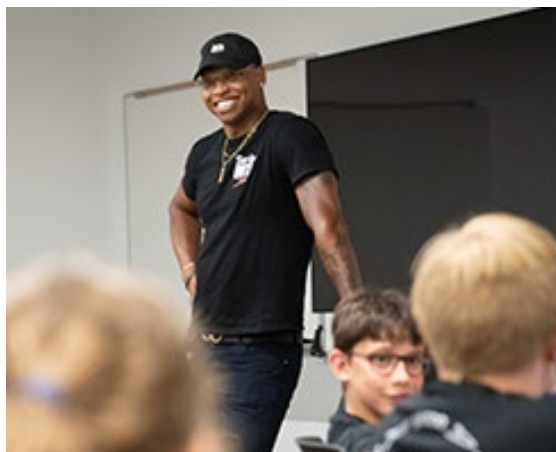
Community Swim Night at Phillips 66 National Championships