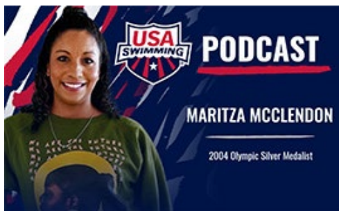
Maritza Correia McClendon

Maritza Correia McClendon was the first Black female to make a U.S. Olympic swim team and